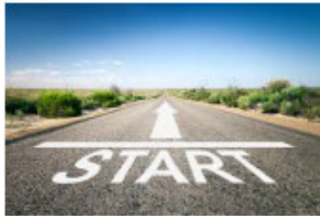
childhood: village in Bavaria