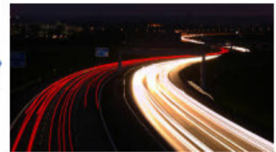
productive PhD in Paris area