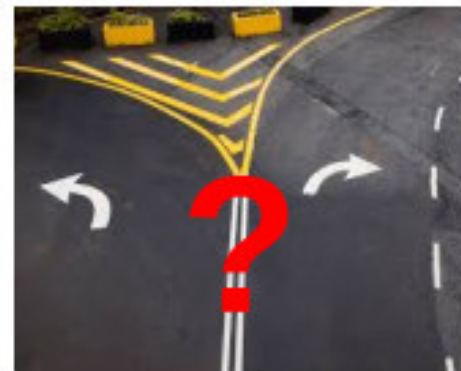
unproductive, frustrating postdoc in Luxembourg