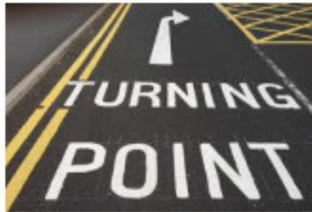
Studies: ~1 year in California